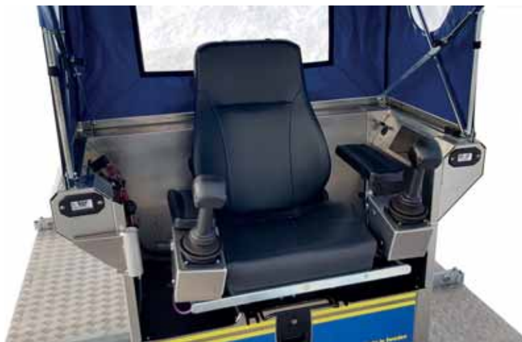
Ergonomic operator's environment with digital screen.

The T-series presents machines with different type of engines, adapted to serve the environmental requirements and conditions on a world market.