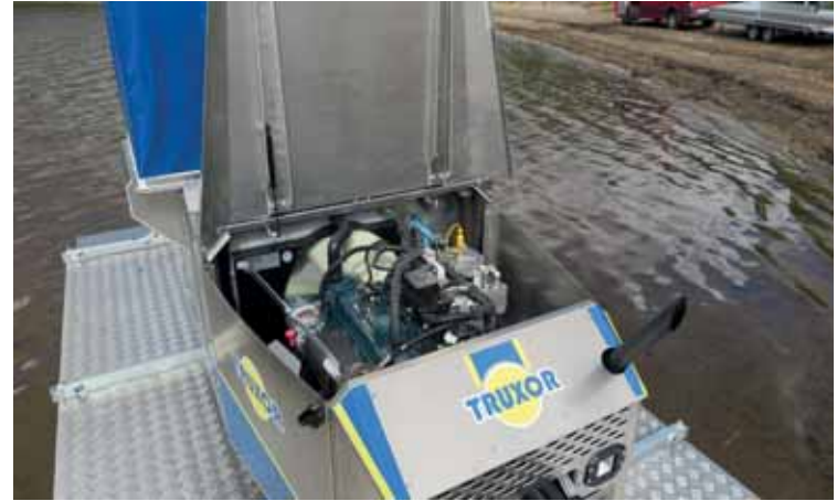
Easily accessible engine compartment facilitates service.