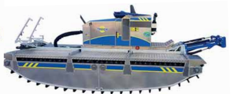
The movable driver's cab is hydraulically adjusted and works as counterweight during heavy lifts in water.