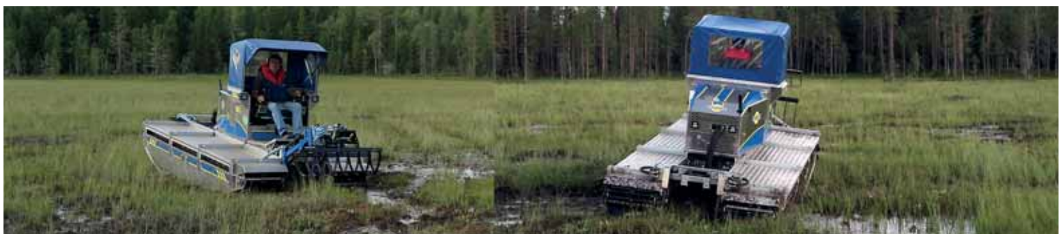
The weight distribution system gives low ground pressure and floating capacity to the machine, offering unique opportunities for work in sensitive environments.