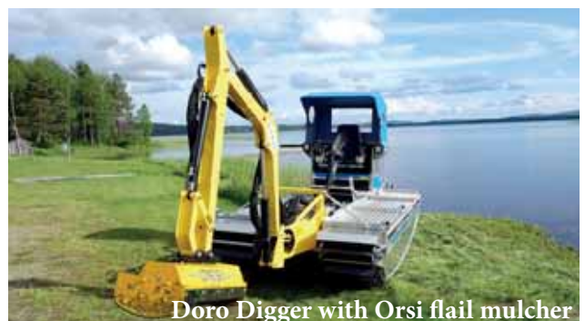
Doro Digger with Orsi flail mulcher

Orsi flail mulcher. A perfect tool that chops vegetation without the need to collect it afterwards. It is recommended for plants and bushes with a diameter of up to 25 mm.