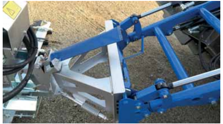
Lifting arm with parallel movement. Semi-automatic quick bracket X4 for fast tool replacement.