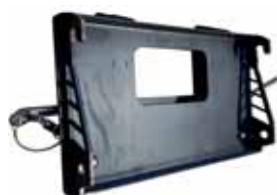
Adapter bracket 72-14000

Recommended only in wetlands with organic material. The miller heads are not included.