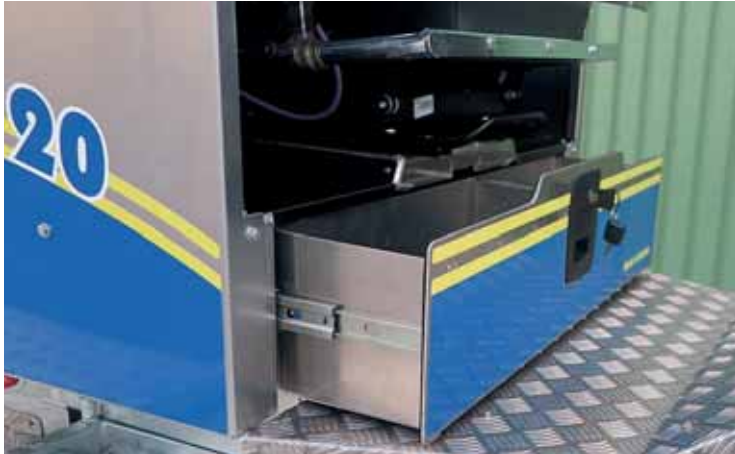
Lockable retractable storage.