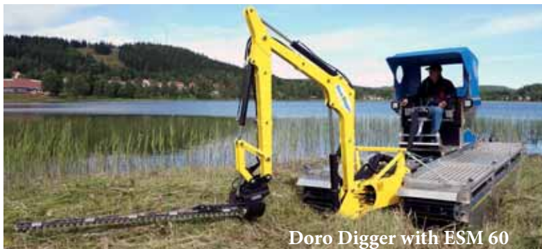
Doro Digger with ESM 60

The Doro cutter ESM 60 effectively cuts vegetation and bushes on shorelines and in wetlands. The ESM 60 can cut most types of plants and bushes up to 25 mm in diameter. The knife beam has knives on both sides and the plants are cut from both directions by the swinging motion of the digging arm. The large working width reduces driving distances in wetlands and minimizes soil surface damage. The ESM 60 is not recommended for use under the water surface.