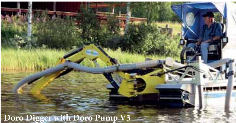
Doro Digger with Doro Pump V3

Examples of Doro digger accessories are excavation